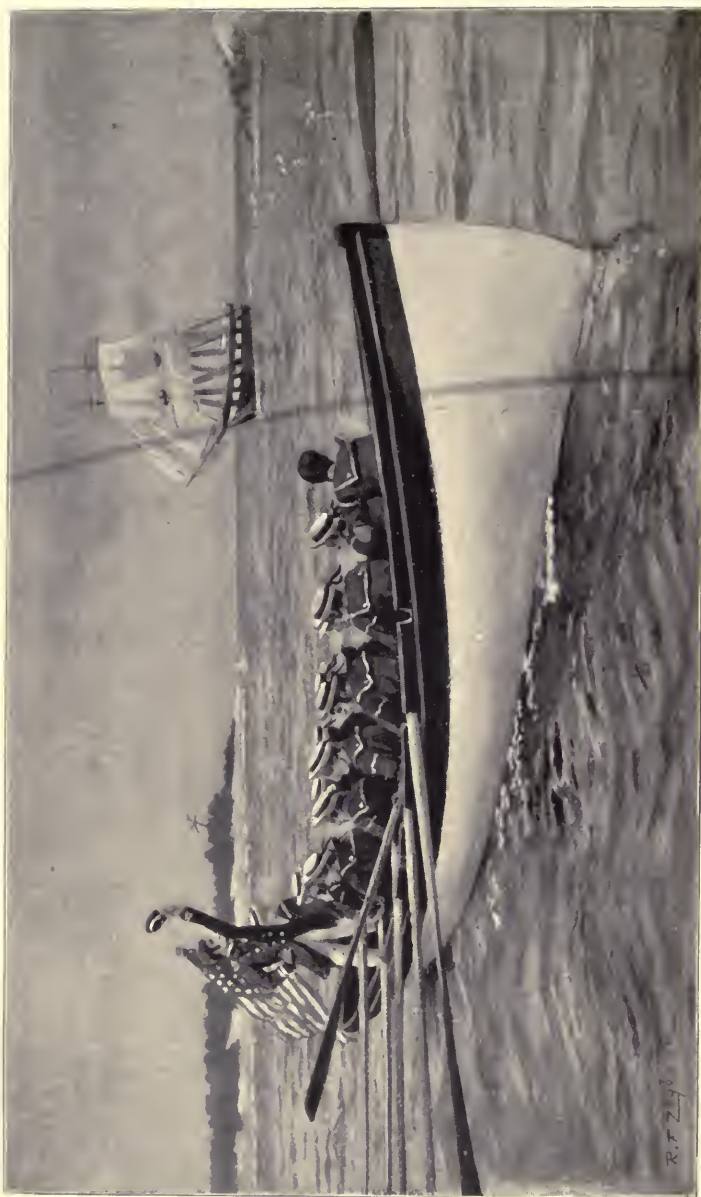
" WALLACE STATIONED HIMSELF IN THE CUTTER, SIGNALING THE SHIP TO COME ON "—PAGE 383